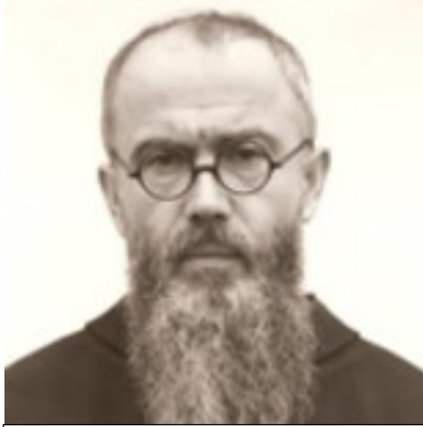
St. Maximilian Kolbe “Patron of our difficult century”

He began publishing the monthly magazine, Knight of the Immaculata in 1922, known today as Immaculata . He founded a