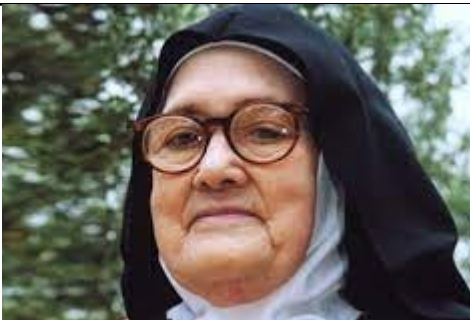
Sr. Lúcia de Jesus Rosa dos Santos, O.C.D.

However, Sister Lucia did provide her own insight to address the question of daily Mass. She said, “I think that God is Father and as Father He adapts Himself to the needs and the possibilities of His children. Now, if God, through Our Lady, had asked us to go to Mass and receive Holy Communion every day, there would undoubtedly have been a great many people who would have said, quite rightly, that this was not possible. Some, on